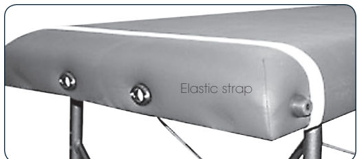
Fig. 3 Elastic strap holds the paper down