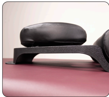
Low profile design with maximum air flow